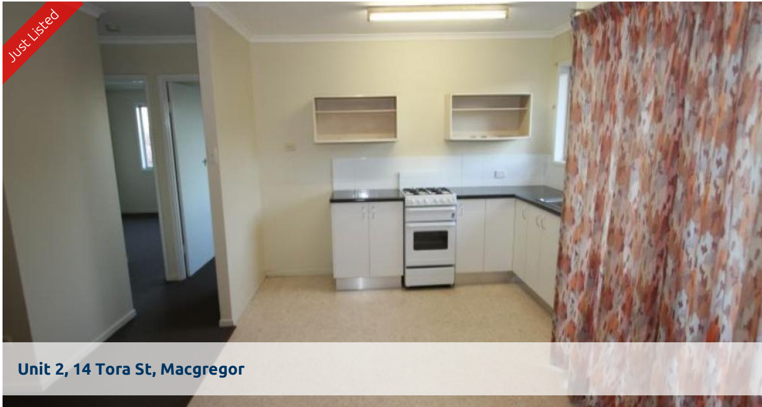
Unit 2, 14 Tora St, Macgregor